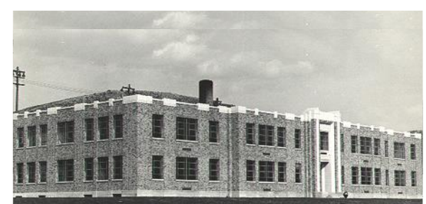
Pharmacy Building, circa 1950, Built in 1942 and renamed Leonard Hall in 1951

The pharmacy program was initially housed in Swanson Hall. In 1926 it was moved to the basement of Farris Hall and in 1928 to the newly constructed Baldwin Hall. In 1942 the program was moved to its present location in the newly completed Leonard Hall, which was built with a state appropriation of $175,000.