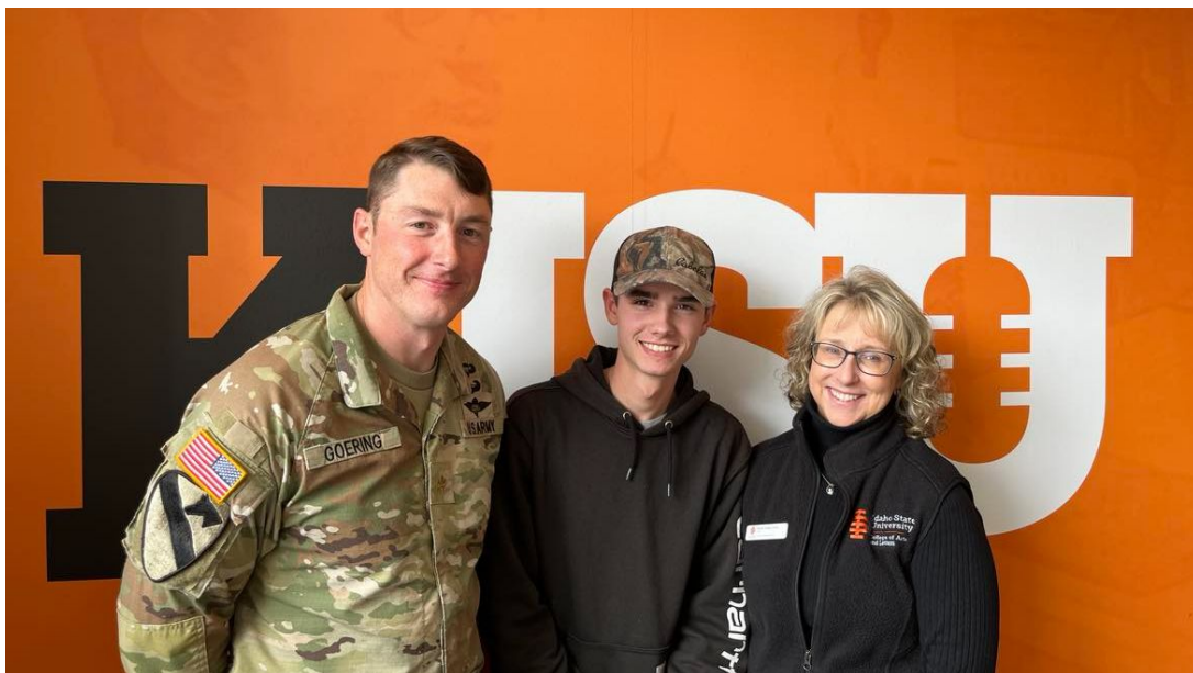
A Day in the Life of an ROTC Cadet at Idaho State University

This semester we had a record number of graduates in the Master of Arts in Spanish program. Cheers to the achievement of the 24 graduates!