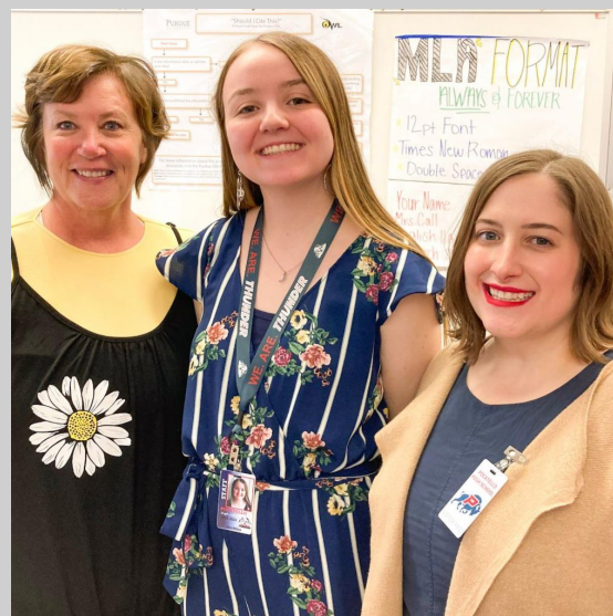
Liberal Arts High: A Taste of Higher Ed