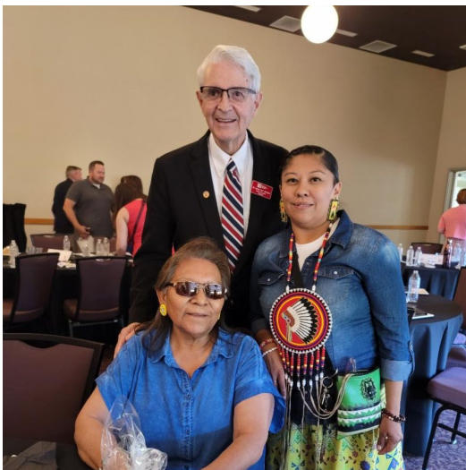
Esto Perpetua Awards