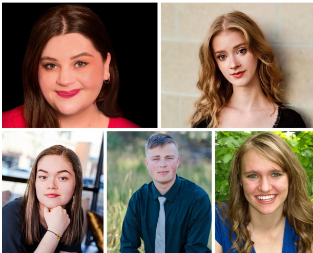
Above: The 2023 ISU NSAC team at regionals