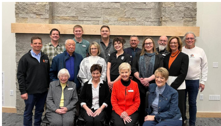
Pictured above, CAL Dean's Advisory board members celebrate the unveiling of the Dean's Advisory Board wall.