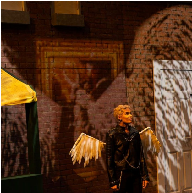
Above: Image of a lead actor in Marisol onstage. A majority of the production was produced by students who were involved with props, scenic, and lighting.