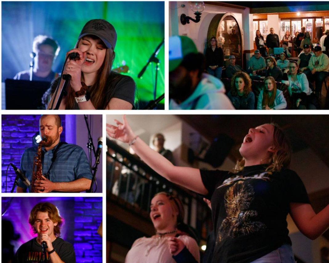
Pictured above: Students and faculty in the commercial music program at ISU perform for a packed house at Union Station.

Thank you for helping make the City Creek record label launch a huge success!