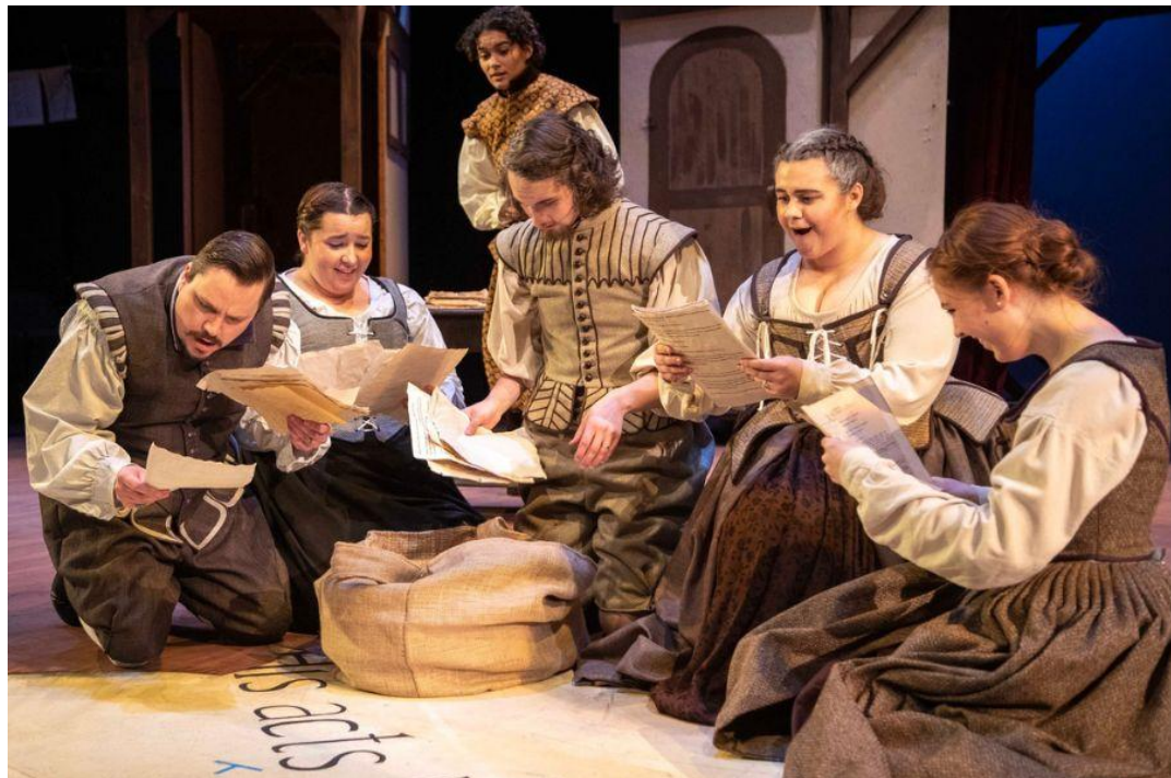
Above: Performance photo of The Book of Will